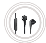
JBL® Hybrid Earphone