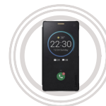
Micro View Case